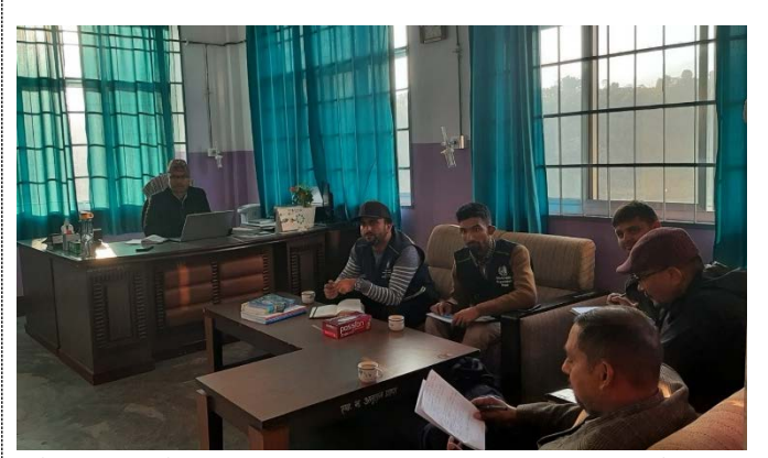
Photo Details: Team from EDCD, MoSDH, PPHL and WHE meeting with Director of HDCS Namuna Community Hospital and Health Section Chief of Sundarbazar Municipality, Lamjung.