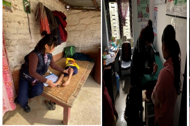
Photo Details: AFP verification at Butwal (Patient from Dhorpatan MP, Baglung) and Darbang PHC of Myagdi