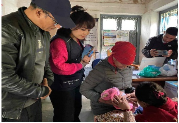
Photo Details: Joint monitoring visit of RI session at Kharbang BHSU with Immunization Officer of Health Office, Baglung