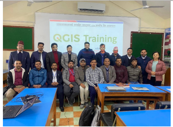
Photo Details: Group Photo after completion of 5 days QGIS Training