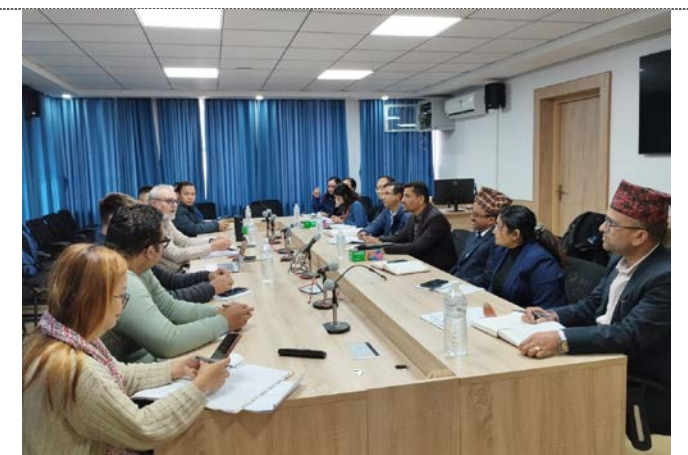
Photo Details: Joint meeting with FAO representatives to discuss on the One Health strategy