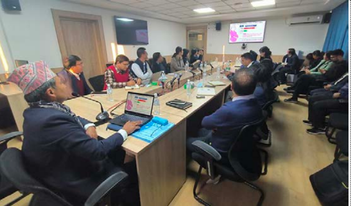
Photo Details: joint meetings with MoSDH, HD and JPP to discuss regarding the MCH Handbook