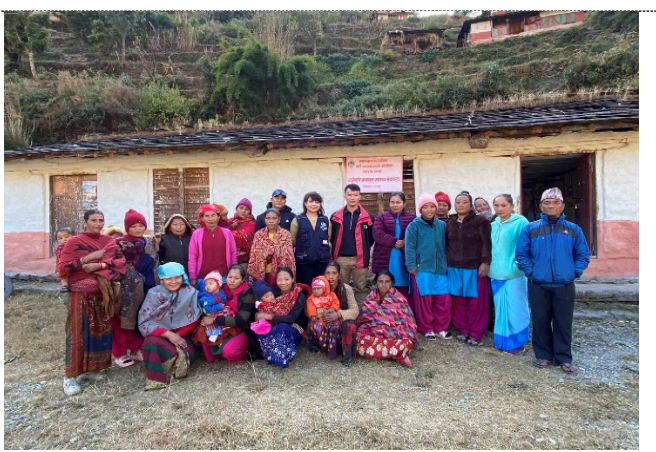
Photo Details: Joint monitoring visit of RI session at Narjakhani BHSU with Immunization Officer of Health Office, Baglung