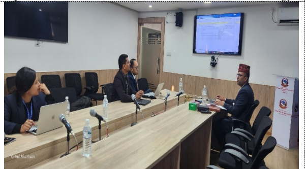
Photo Details: MoSDH Team reviewing the implementation status of Fifth Human Right National Plan of Action 2077/78-2081/82)