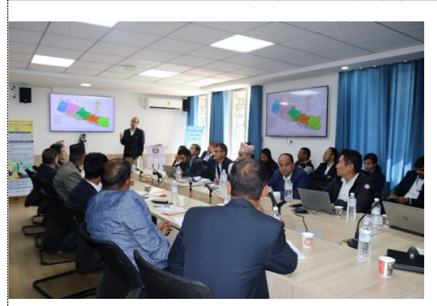
Photo Details: orientation program on Antimicrobial Resistance during WAAW week, MoSDH hall.