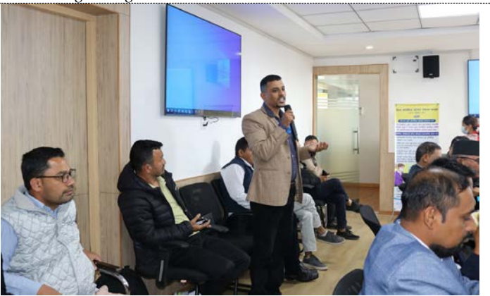
Photo Details : PHO facilitating the interaction meeting on AMR orientation program